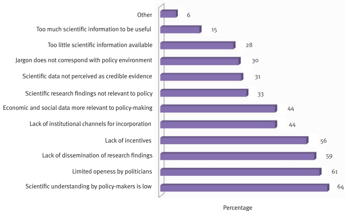
Figure 2: Obstacles to the uptake of scientific information in development policy-making

the policy context, along with the habits, values and traditions of policy-makers, and the influence of lobbyists and pressure groups (Davies, 2005). Increasing the usage of evidence in policy-making therefore requires a communication approach that is informed by an understanding and engagement with these competing influences.